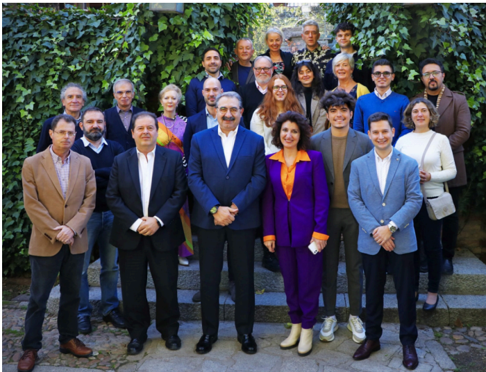
The MammoScreen Consortium

ELAROS and UBT bring complimentary expertise to the collaboration. ELAROS brings skills in the development of digital platforms, apps and PPIE. UBT brings expertise in the development of new screening devices that use Artificial Intelligence (AI) algorithms that drive the interpretation of the images generated by their proprietary MammoWave devices.