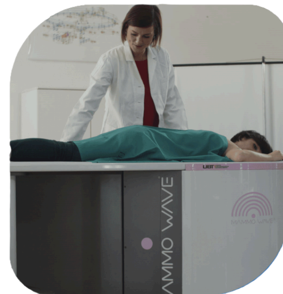
Patient undergoing a mammogram using the MammoWave device

"This approach really changes the way we approach prevention, especially in younger women and allows us to use resources in a targeted, safe and effective manner"